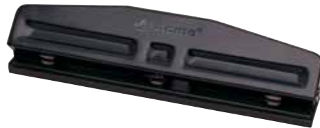
00586 Adjustable light duty 3 hole punch