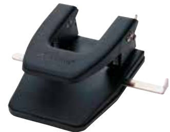
00582 Adjustable two hole punch