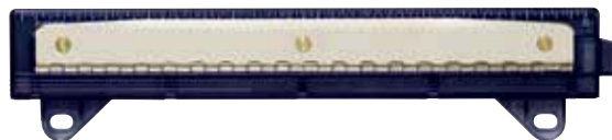
05834 KleenEarth 3 Hole punch with Microban® - fits a 3 ring binder - black