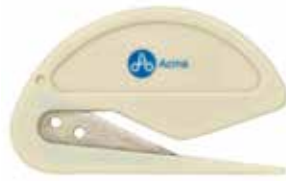
00297 Mini "Zip" style letter opener, bulk 02972 2 pk mini "Zip" style letter openers, carded