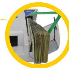
Side Load Hopper