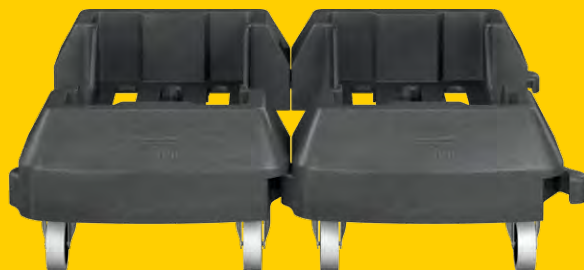
Resin Trainable Dolly