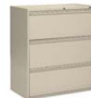
MVL1936P3 3 High