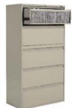
MVL1936P5 5 High