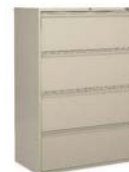
MVL1936P4 4 High