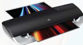
GBC® Fusion™ 3100L