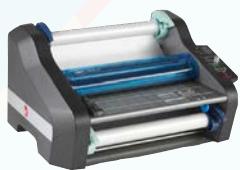
GBC® Ultima® 35 EZload®