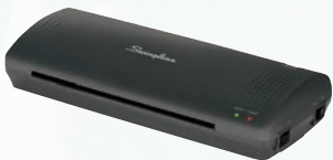
Swingline® Inspire™ Plus