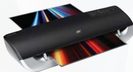
GBC® Fusion™ 3000L